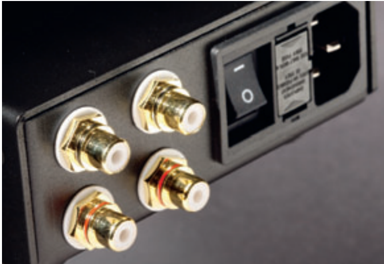
ABOVE: Not two inputs but a combination of L/R stereo input and variable preamp output, controlled off the same volume control as the two front headphone sockets

Lehmann's Black Cube Linear also scores with its fabulously low distortion, just 0.0003% through bass and midrange and rising to an insignificant 0.0025% at 20kHz [see graph 2, below]. Noise is vanishingly low too, sufficient to raise an A-wtd S/N ratio of 99dB in its +10dB gain mode. This is 20dB ahead of the PS Audio amp tested two years ago! These figures, together with its maximum output of 9V and input overload of 6.1V, suggest the Black Cube Linear is as near a bomb-proof solution as you'll find. Readers are invited to view a comprehensive QC Suite test report for the Lehmann Black Cube Linear headphone amp by navigating to www.hifinews.co.uk and clicking on the red 'download' button. PM