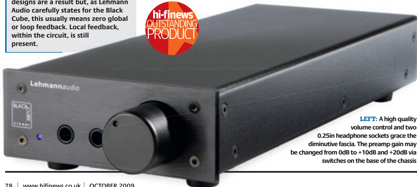
LEFT: A high quality volume control and two 0.25in headphone sockets grace the diminutive fascia. The preamp gain may be changed from 0dB to +10dB and +20dB via switches on the base of the chassis